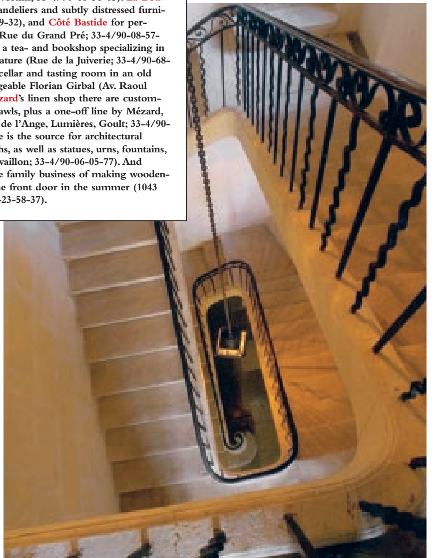
La Bastide des Fontaines