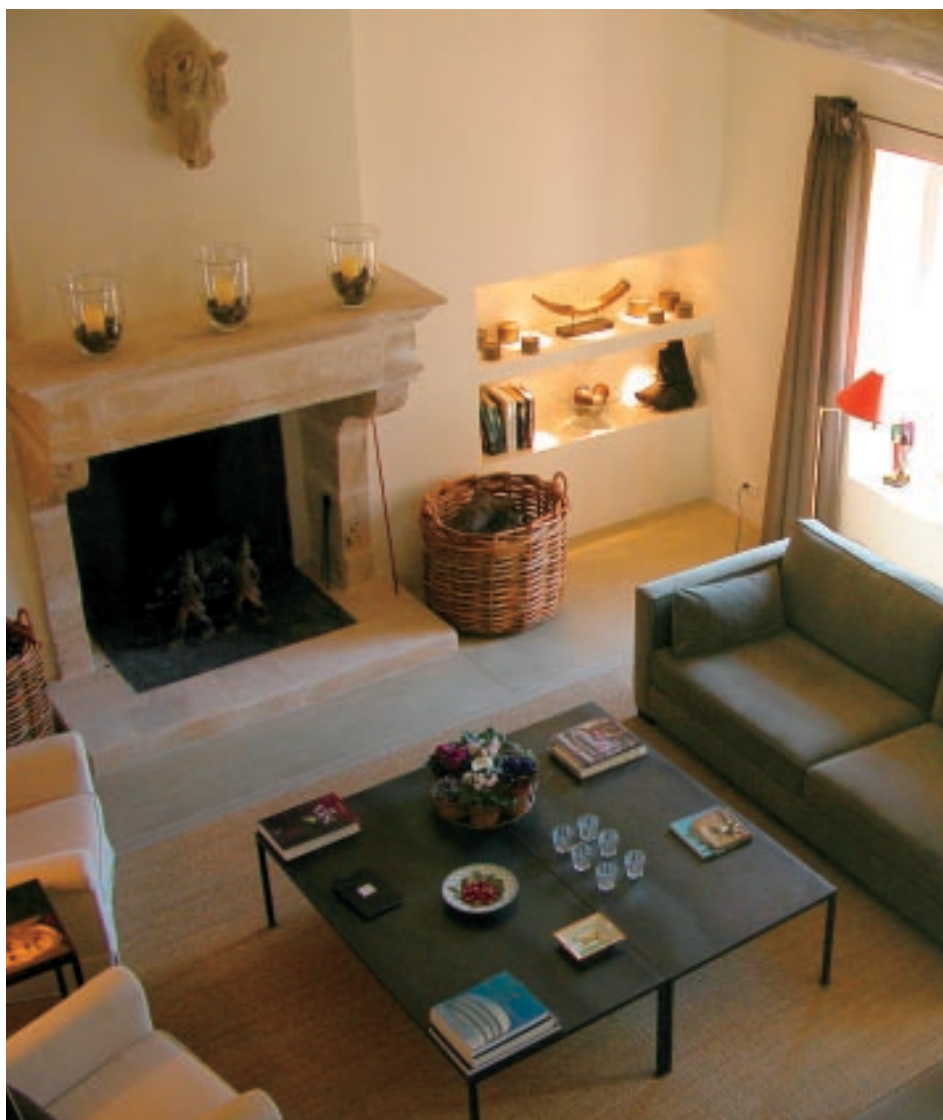
Domaine des Oliviers